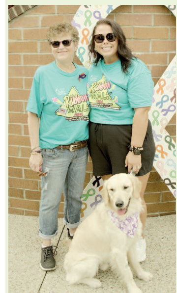
Lots of furry friends this year!