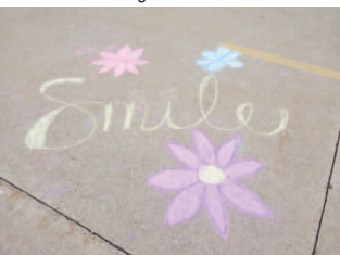
A hopeful message from the Chalk Zone