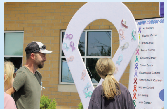
Attendees remembered loved ones lost to cancer by pinning their name on the Ribbon Board.