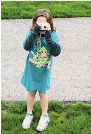
A young girl capturing the moment