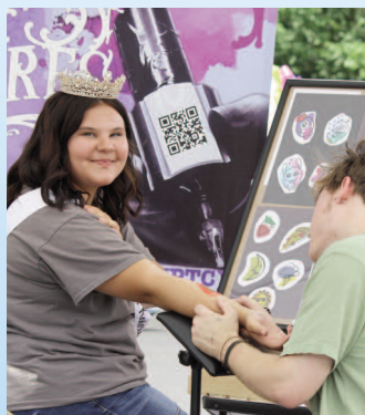
Moving Pictures Tattoo Cinema offered free Sharpie tattoos at the event.