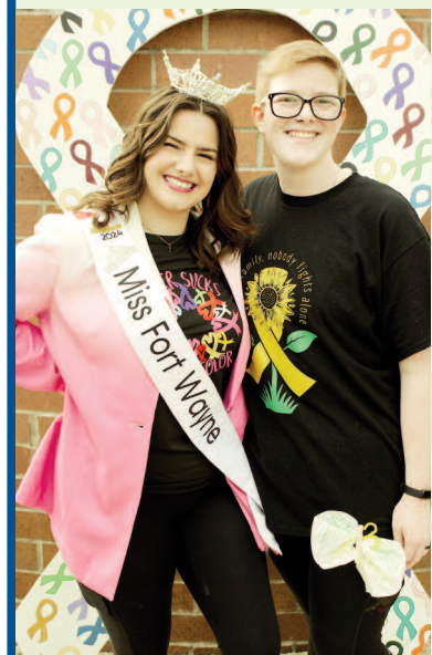
Miss Fort Wayne attended to support local people with cancer