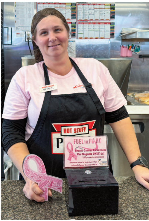
Last October, McIntosh Energy sold breast cancer awareness magnets at their local MacFood Mart convenience stores.