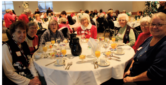
It was an honor to thank all the volunteers who help local people with cancer. Pictured here is "The Originals" Sewing Group from Zion Lutheran Church in Columbia City.

On December 1, Cancer Services celebrated all the volunteers who join us in our mission to help people with cancer. The efforts of all volunteers are appreciated and celebrated.