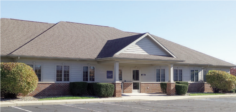
Cancer Services West at 2190 North Pointe Dr. in Warsaw

Because of you, friends and neighbors in and around Kosciusko, Noble, Whitley, and Wabash counties can get help closer to home.