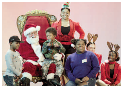
Attendees at the 2022 Christmas party along with special guest Santa Claus.