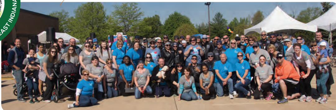
The Blacktop Mafia Motorcycle Club and Fort Wayne Medical Oncology and Hematology rally support at Lapper.