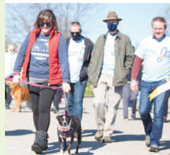
Team Unbreakable led by a furry friend.