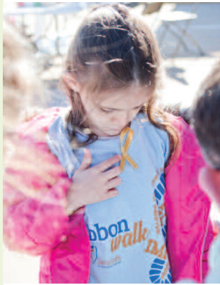
Wearing a gold ribbon for Childhood Cancer awareness.