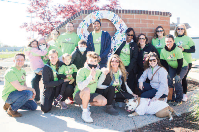
The Bulldogs Team from Bulldog Consulting Services.