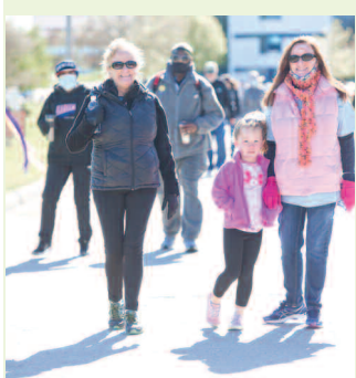
The 2021 Ribbon Walk path was three-quarters of a mile.

Steve Incremona Why fly when you can drive, why drive when you can run, why run when you can walk, why walk when you can stay home and watch TV ?