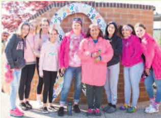
The Titty Committee Team.