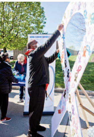
By the event's end, the ribbon board was adorned with dozens of handwritten notes.