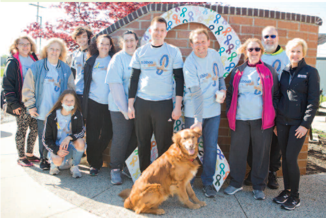
Fire Police City County FCU's Ribbon Walk team.