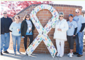
The Mix @ Chapel Team.