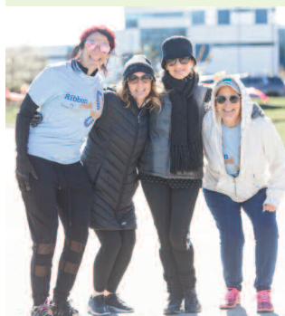
Participants walk to honor family, friends, and coworkers touched by cancer.