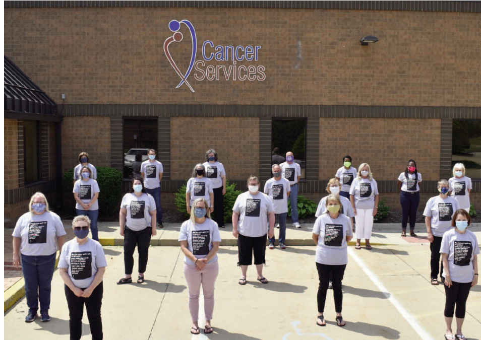
Cancer Services staff is geared up to safely help people with cancer.

Your help is needed more than ever. Your donation will help provide mental health counseling, needed equipment and supplies and financial assistance to people with cancer. Your gift helps local families battling cancer.